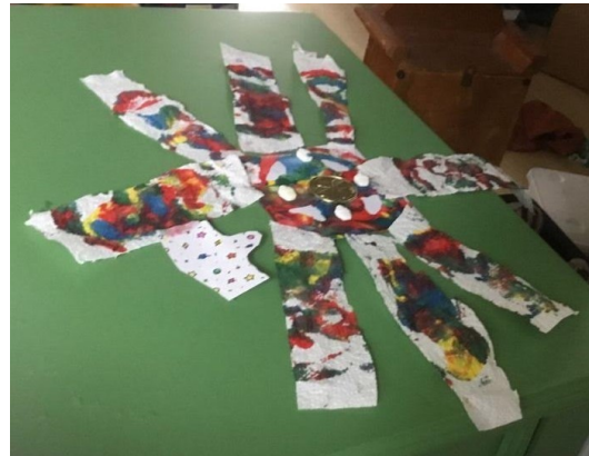
Found object flower—Evie Whitaker